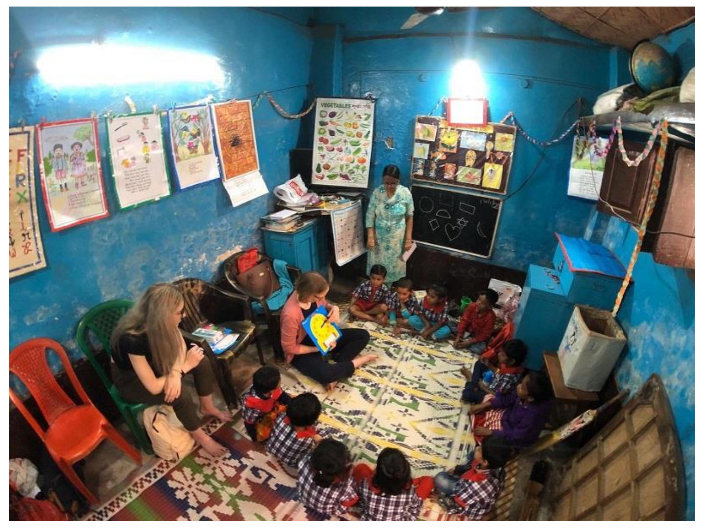
Bird's eye view of the classroom at Bibibagan

The attention of everyone is presently dominated by the global COVID-19 pandemic, and our first article is the appeal to support the relief operation made necessary by the lockdown. But we also want to share the positive news this Eastertide about recent developments at different CRS projects, and the wonderful work of CRS as seen through the eyes of a number of recent visitors.