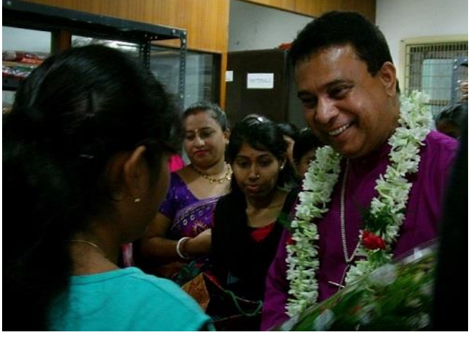
Bishop Canning meeting women at Nari Dana

At the end of September Bishop Canning made a day trip to see some of the work of CRS in rural areas, including the village of Mahamaya, where building work on the expansion was almost complete.