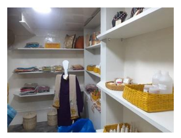
The new display area in Bishop's House

The vehicle serves a different location each day giving as many women as possible the advantage of transport for at least one day per week. This has increased the regularity of attendance.