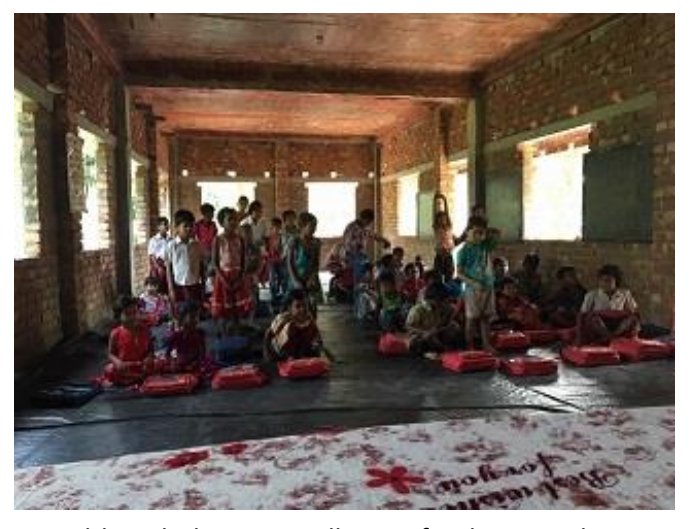
Although there are still some finishing touches needed to the building, the rooms are used every day for school and the women's programme

As well as storytelling, singing is another effective way to teach language. Our daily exercise each morning came from singing many rounds of 'Head and shoulders, knees and toes' and other action songs. Seeing the delight, smiles, engagement and enthusiasm from these children was such a joy.