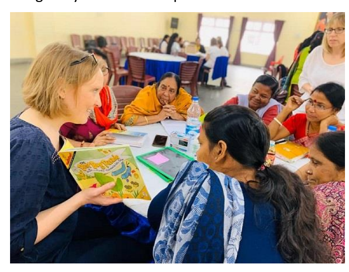
Learning how to use storytelling for teaching English

The visitors also hosted two day-long continuing professional development workshops for all CRS teachers. At each table there was demonstration and practice of different techniques for teaching using storybooks and simple resources.