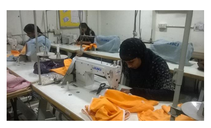
At work on the Juki sewing machines