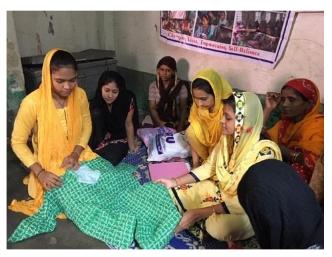
Training for women at the CRS centre at Bibibagan

This opens up the option of additional training on professional electrically powered sewing machines located at central the Nari Dana production centre.