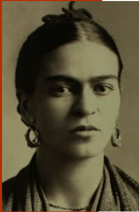
Frida Kahlo