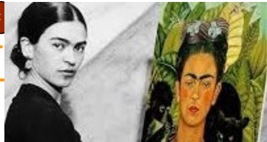
Frida working on a self-portrait

Frida remained in pain for most of her life. She was very strong to be an artist despite the severe pain. Today, people visit her home in Mexico to see where her great art was created and to appreciate what she accomplished against all the odds.