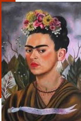
Frida Kahlo 'Self Portrait' 1940

Frida was proud of her Mexican heritage. She was influenced by traditional Mexican art which is full of colour, with bright, patterned, symbolic art. She often painted Mexican animals in her self-portraits, such as monkeys and parrots.